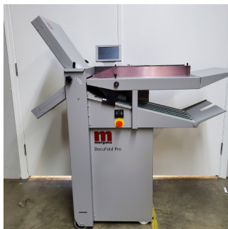
Morgana Docufold Pro $10,995 $9,995 Automated high-speed air feed folder w/perf