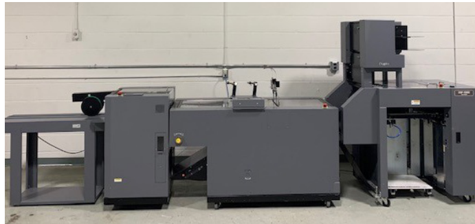
DSF 5000 High-Capacity Booklet System Configured w/ DSF 5000 set feeder w/optional cover feeder, SCC side slit/crease module, DBM 500 Bookletmaker w/optional spine flattener & 500T face trimmer. Please call to discuss configuration requirements and price.