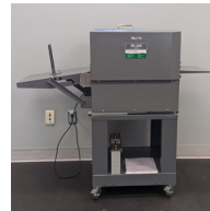
Duplo DC-445 $8,995 $8,495 Air suction feed; up to 15 creases; 3000 sph