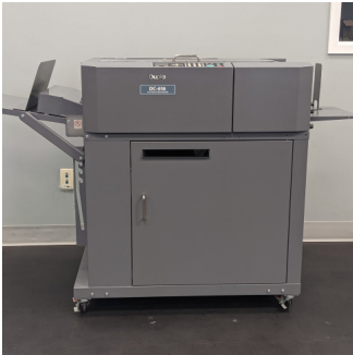
Duplo DC-616 Pro Slitter/Cutter/Creaser $17,500 $16,500 Low counts; includes perf unit