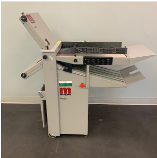
Demo Model Morgana Major Folder $7,995 $7,495 18 x 25 high-speed air feed folder w/ perfling