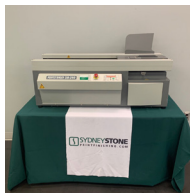
DB 280 Perfect Binder $6,495 $5,995 Books 1.97" x 3.15" to 12.6" x 15.75" up to 1.6" thick