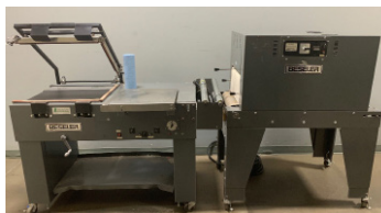
Beseler T-18-8 Shrinkwrapping System $8,995 $8,495 18" wide, 8" tall and 36" long tunnel chamber w/ adjustable air damper and auto cool down .