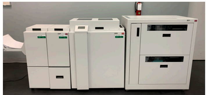
Morgana AF 2000S Bookletmaker $39,995 $37,495 AF 602 set feeder with two high pile bins; BM 2000S bookletmaker includes 4 ISP heads with inline face trimming and squareback unit; Fully automatic bookletmaking with 30 sheet capacity