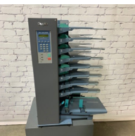
DSF 8 Collator $2,995 $2,495 8-bin collator; perfect addition to your Duplo bookletmaker system