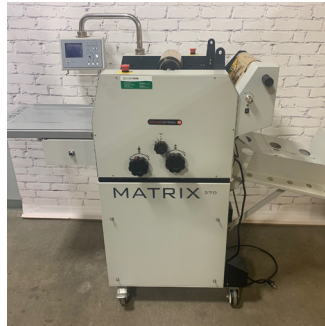
Matrix MX 370 Laminator $11,995 $10,995 15" W Single-sided laminator w/ foiling kit