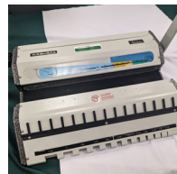
WBM 532 Wire Closer $295 $250 Manual closer for wire-bound applications