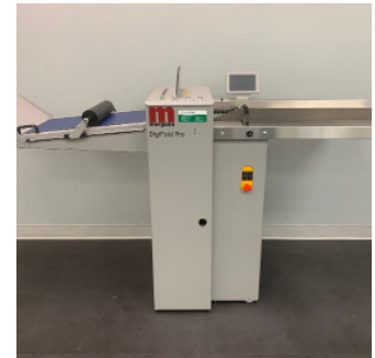
Morgana Digifold Pro Creaser/Folder $24,995 $22,495 Crease and fold up to 6000sph