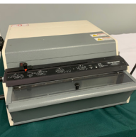
RoT HD 7700 $3,995 $3,495 Punch up to 55 sheets; Includes 4:1 coil die