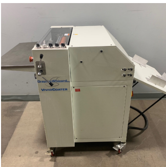
Vivid UV Coater $7,995 $7,495 Up to 2700sph; stocks up to 400gsm