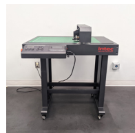
Intec FB700 XY Cutter $5,995 $5,495 Cut/crease custom shapes, no die required.

RECONDITIONED EQUIPMENT INCLUDES 100-DAY PARTS & LABOUR WARRANTY | CONTACT US TODAY! 1-800-668-6055 OR SALES@PRINTFINISHING.COM